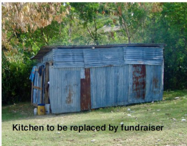
Kitchen to be replaced by fundraiser

Since their formation the group has performed in churches and concert halls around the Pacific Northwest and as far away as Leon, Spain.